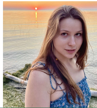
2022 ELGEF Scholarship Recipients

Goal of ELGEF: To make financial and/or other resources available that enhance the educational opportunities and activities for our students not funded by the general operating budget.