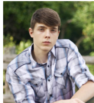
2020 ELGEF Scholarship Recipients

Goal of ELGEF: To make financial and/or other resources available that enhance the educational opportunities and activities for our students not funded by the general operating budget.